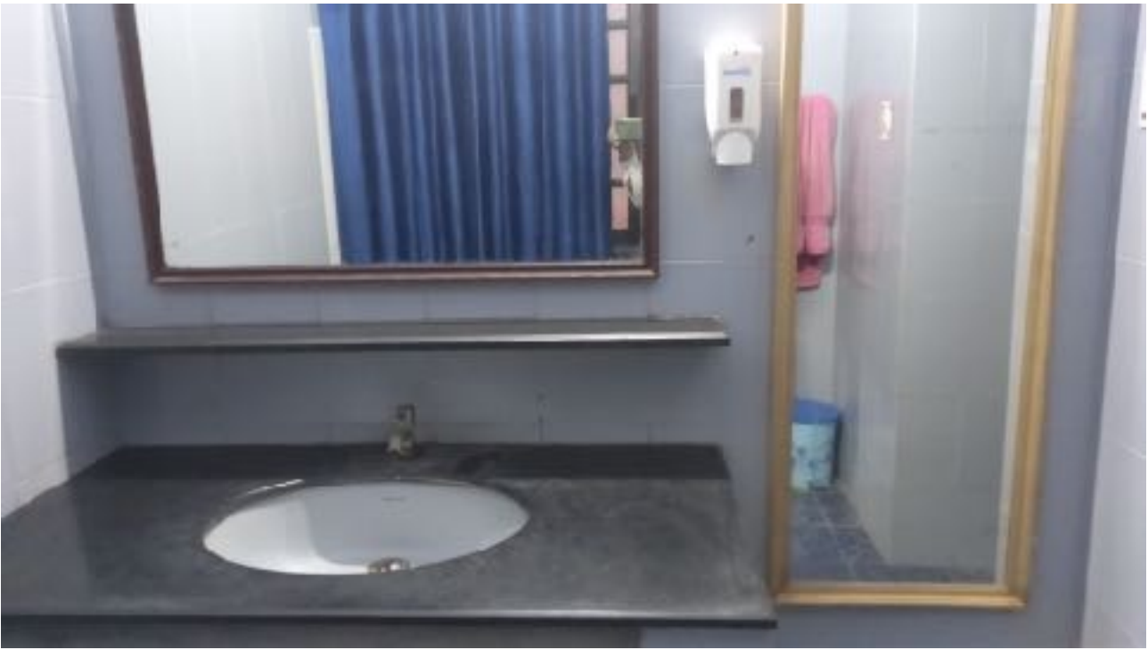
Female Faculty Washroom