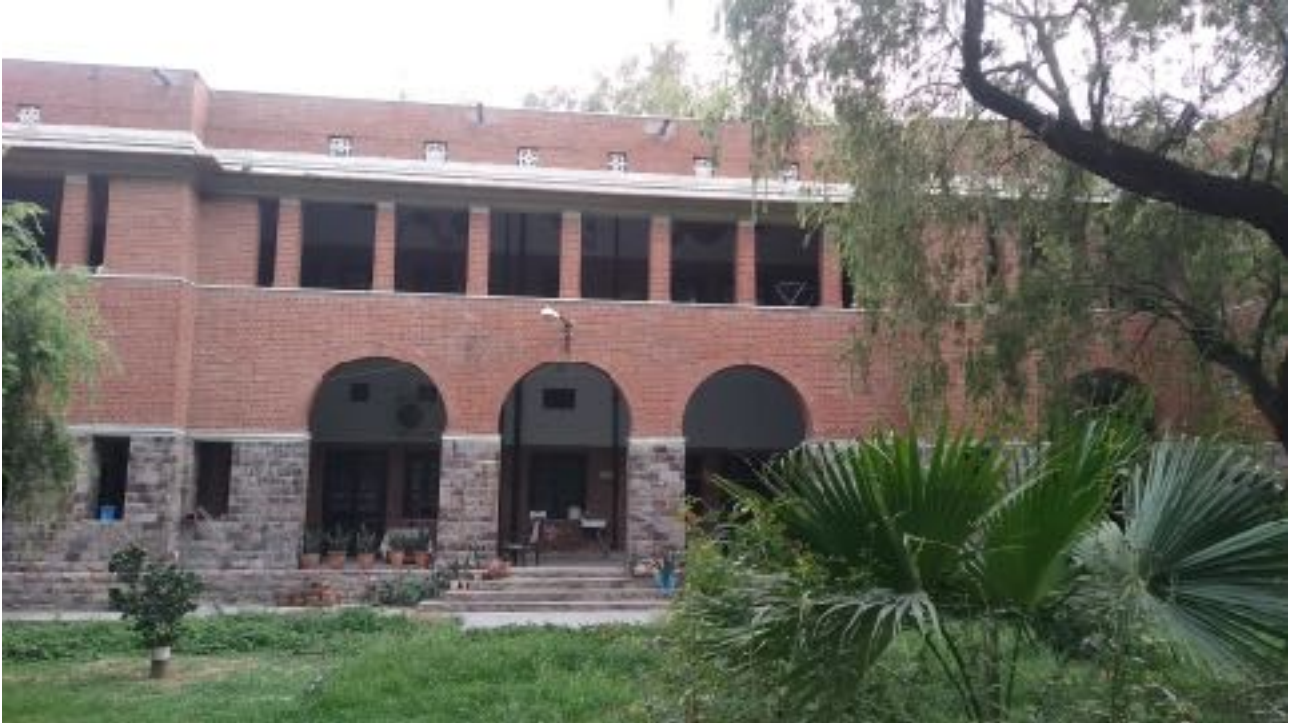
Female Residence Rudra North Block