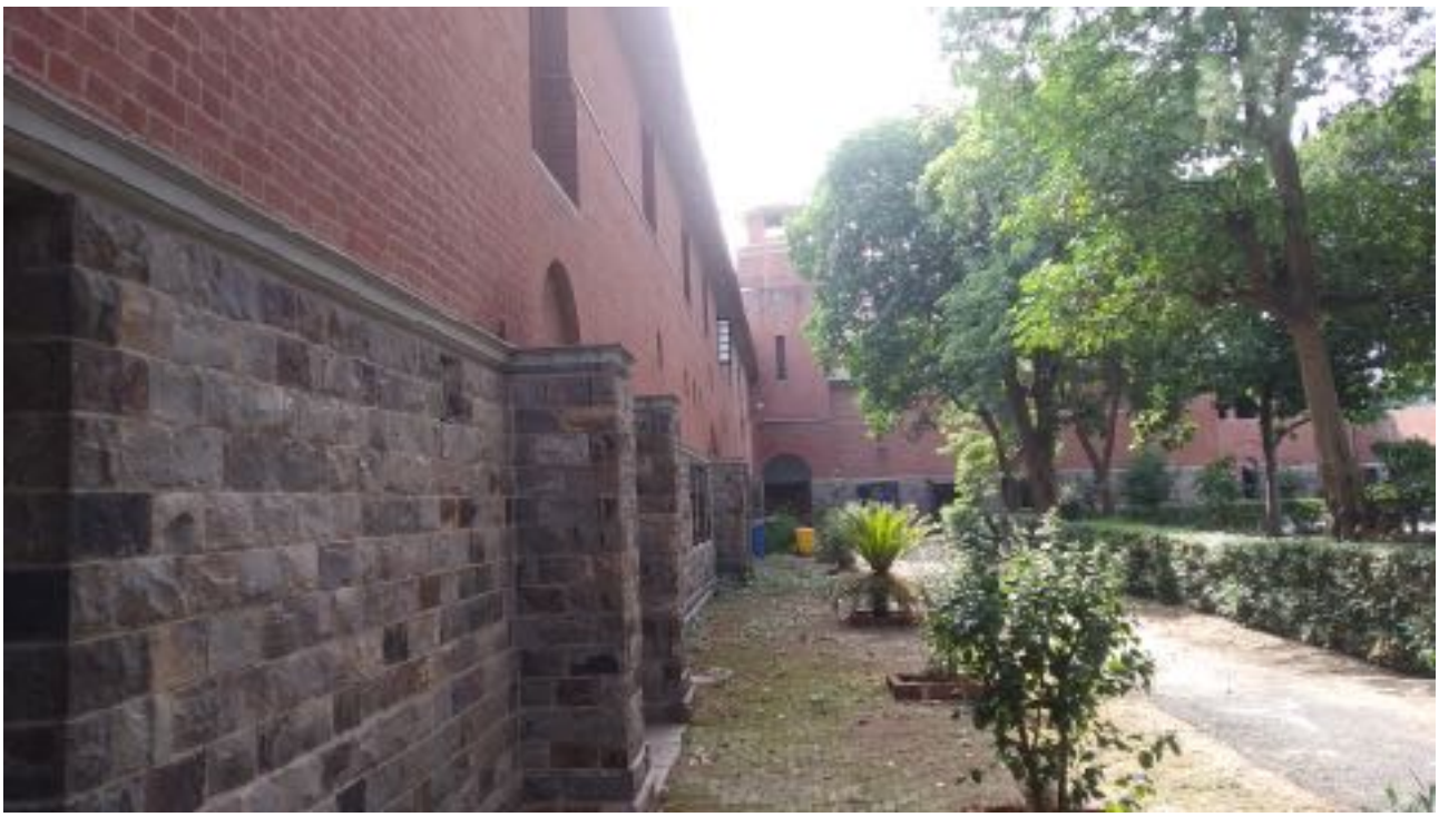
Female Residence Allnutt South Block