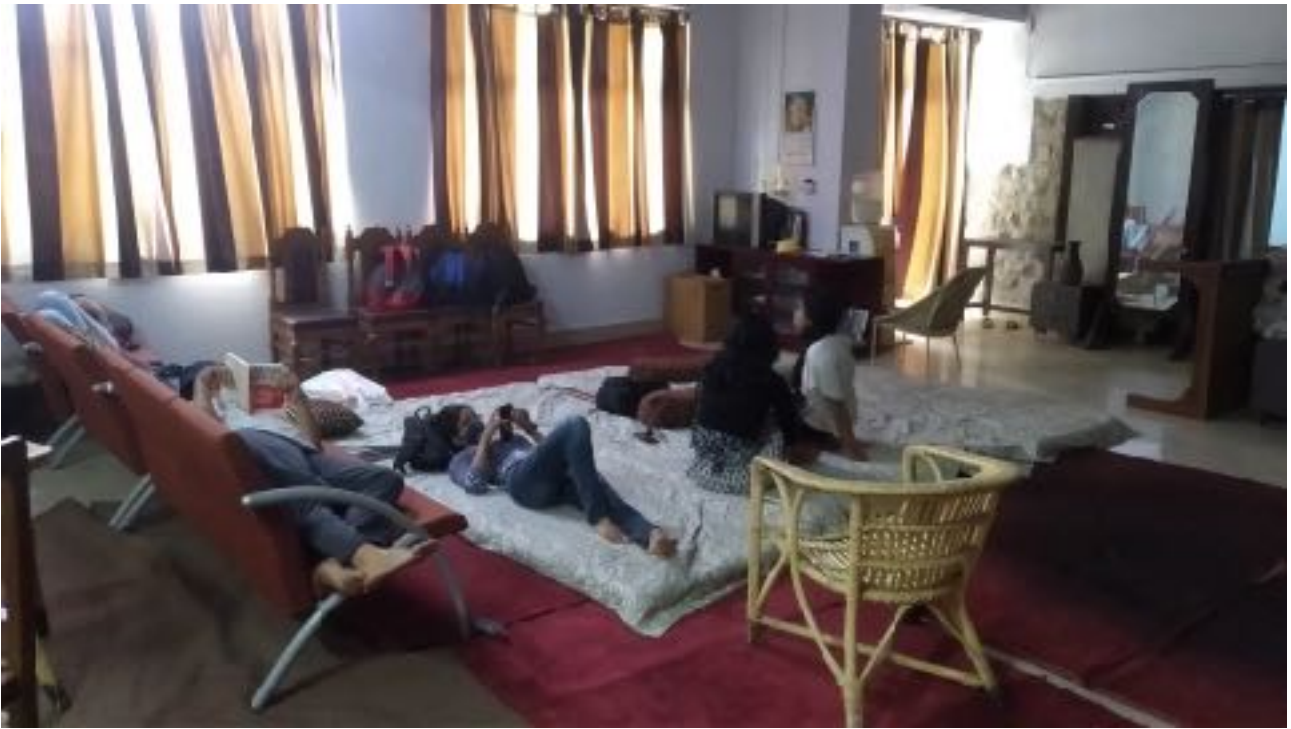
Ladies Common Room