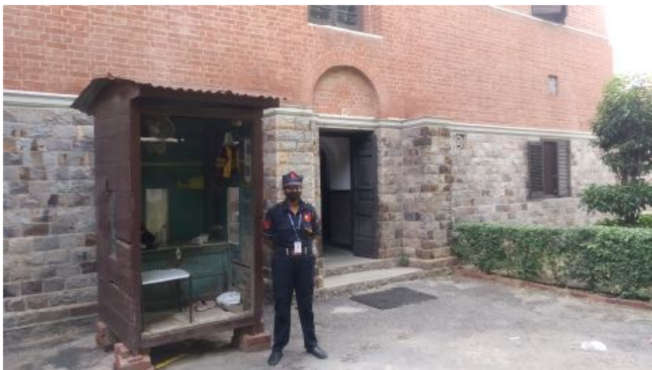
Female Guard Outside Allnutt South