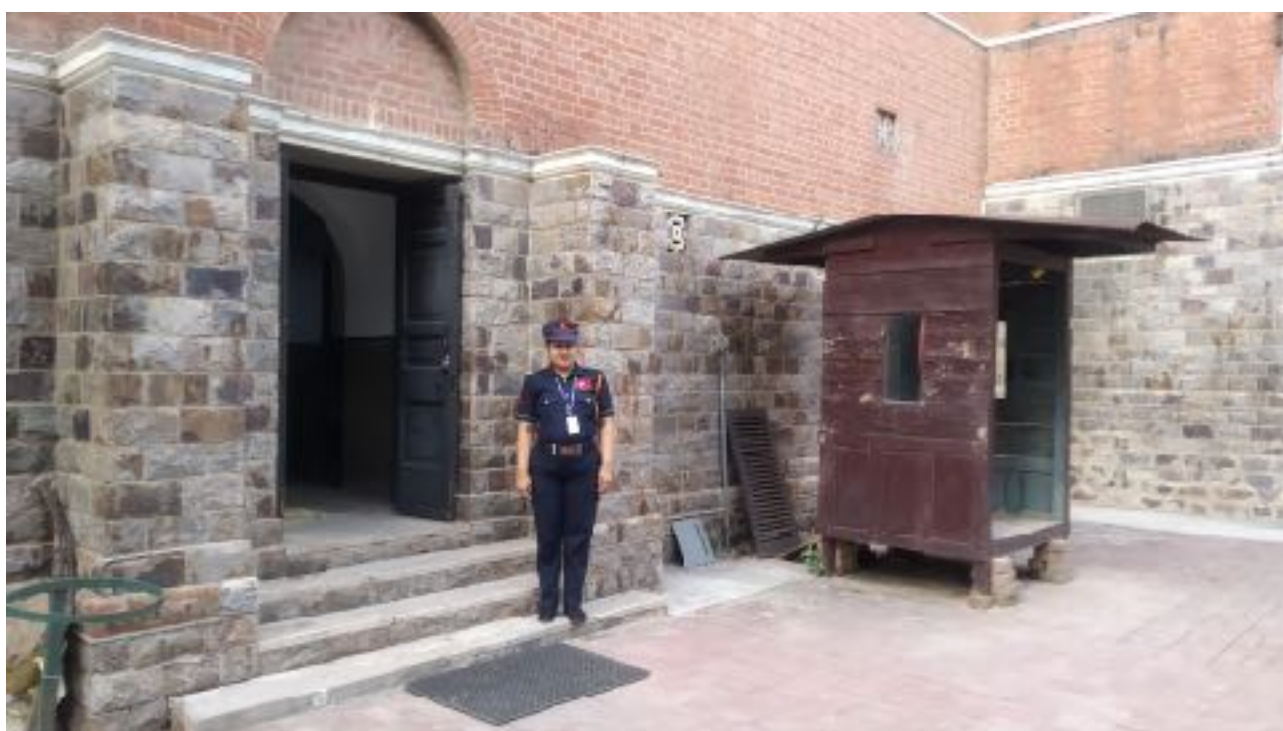
Female Guard Outside Rudra North Block