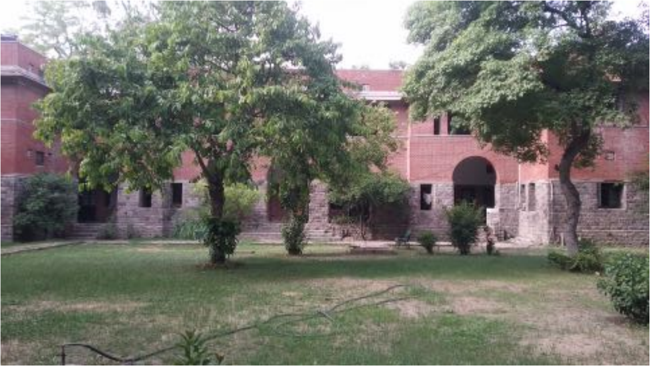
Female Residence Rudra South Block