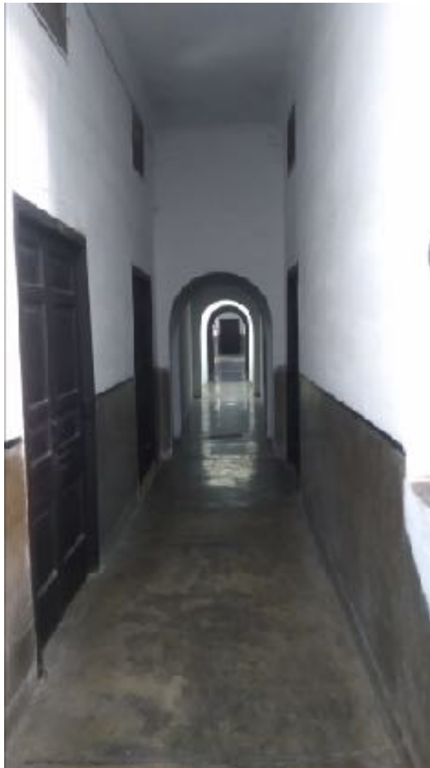
Female Residence Rudra South Block