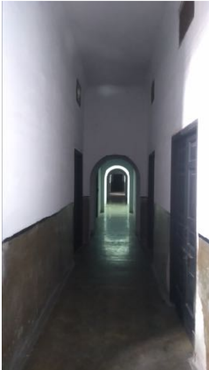
Female Residence Rudra North Block