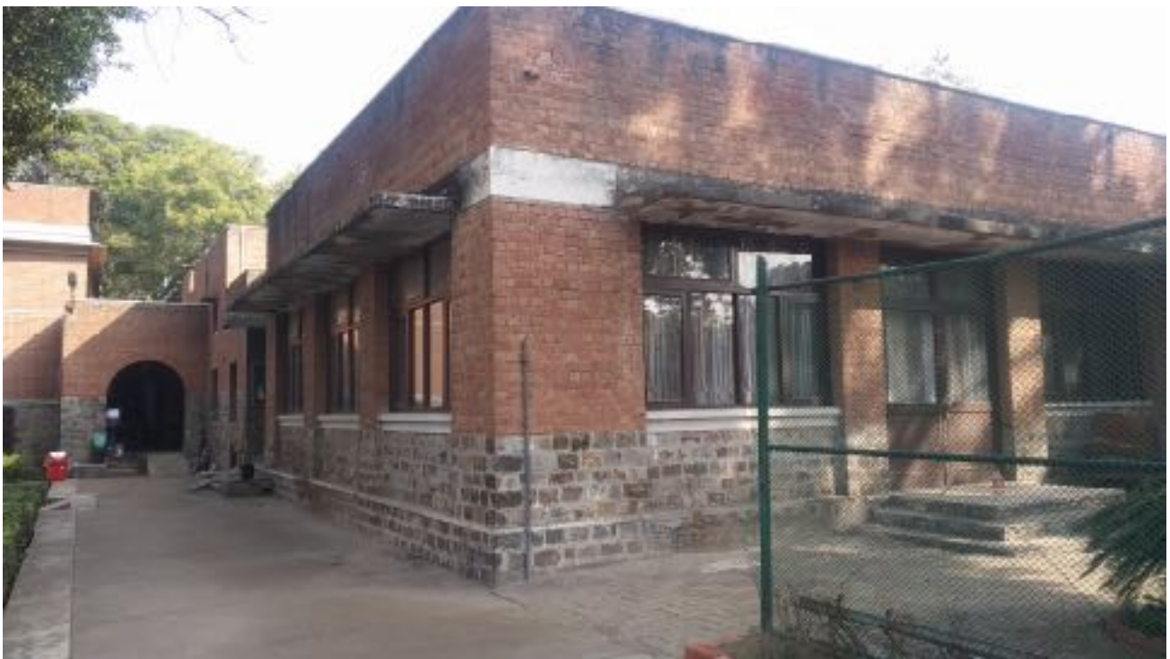
Ladies Common Room