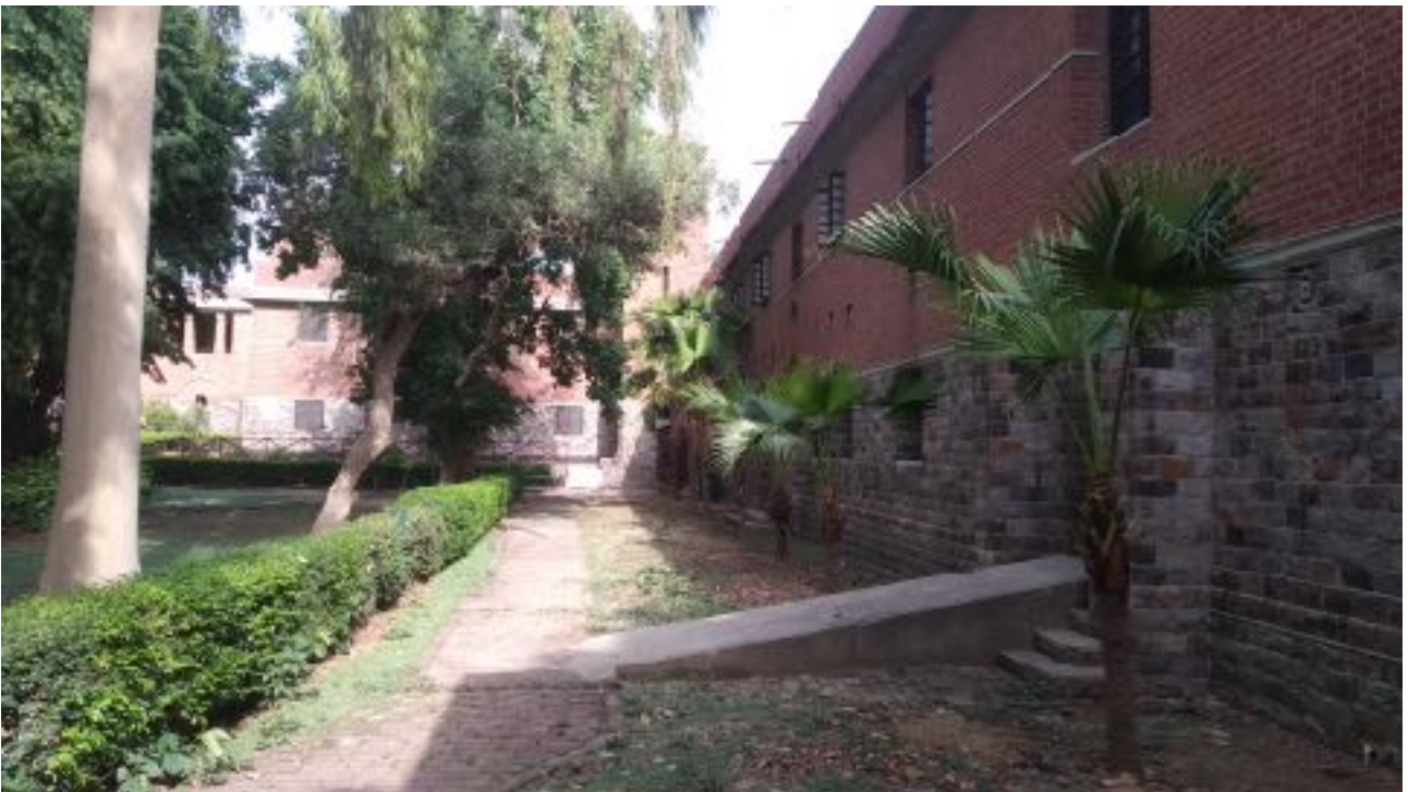
Female Residence Rudra South Block