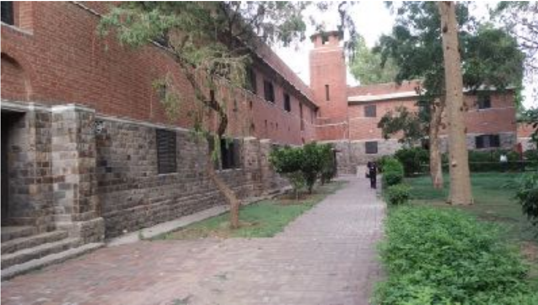
Female Residence Rudra North Block