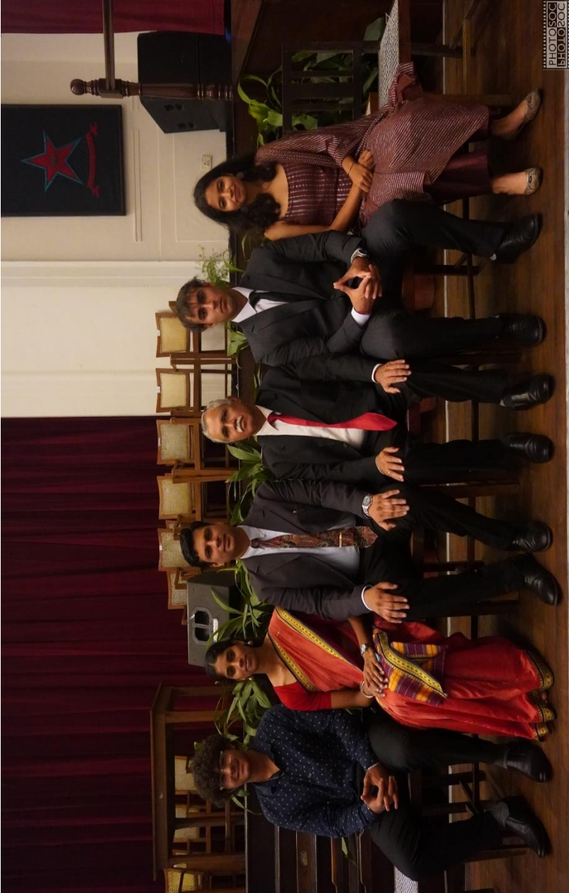
St. Stephen's College Team -- LAWN TENNIS (Men)