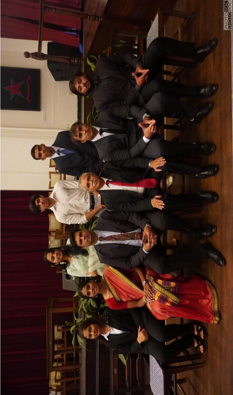
St. Stephen's College Team – SHOOTING (Women)