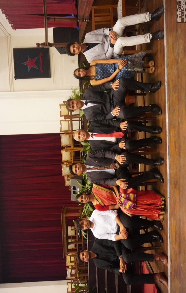
St. Stephen's College Team – BADMINTON (Men & Women)