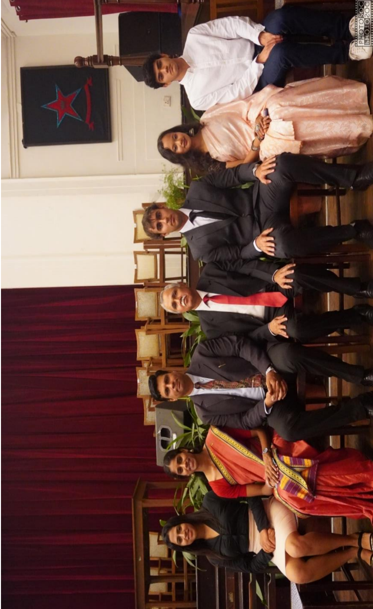
St. Stephen's College Team – AQUATICS (Men & Women)