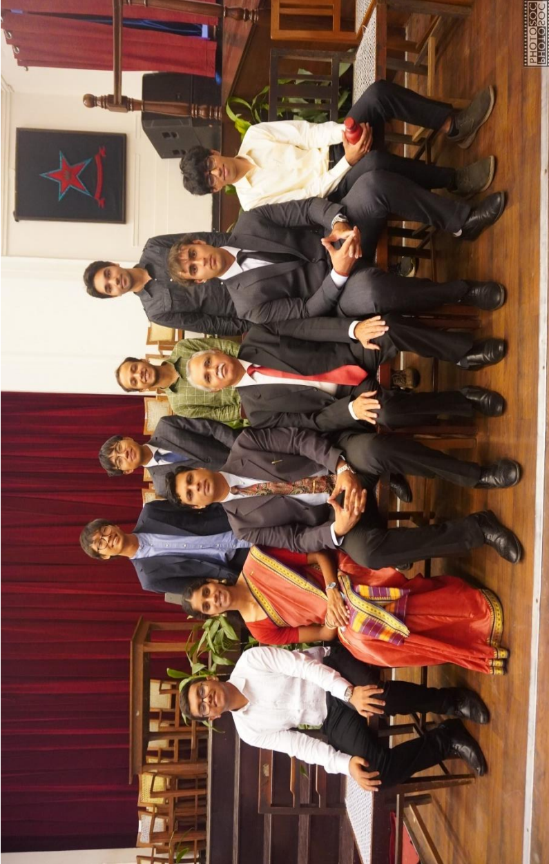
St. Stephen's College Team – CHESS (Men)