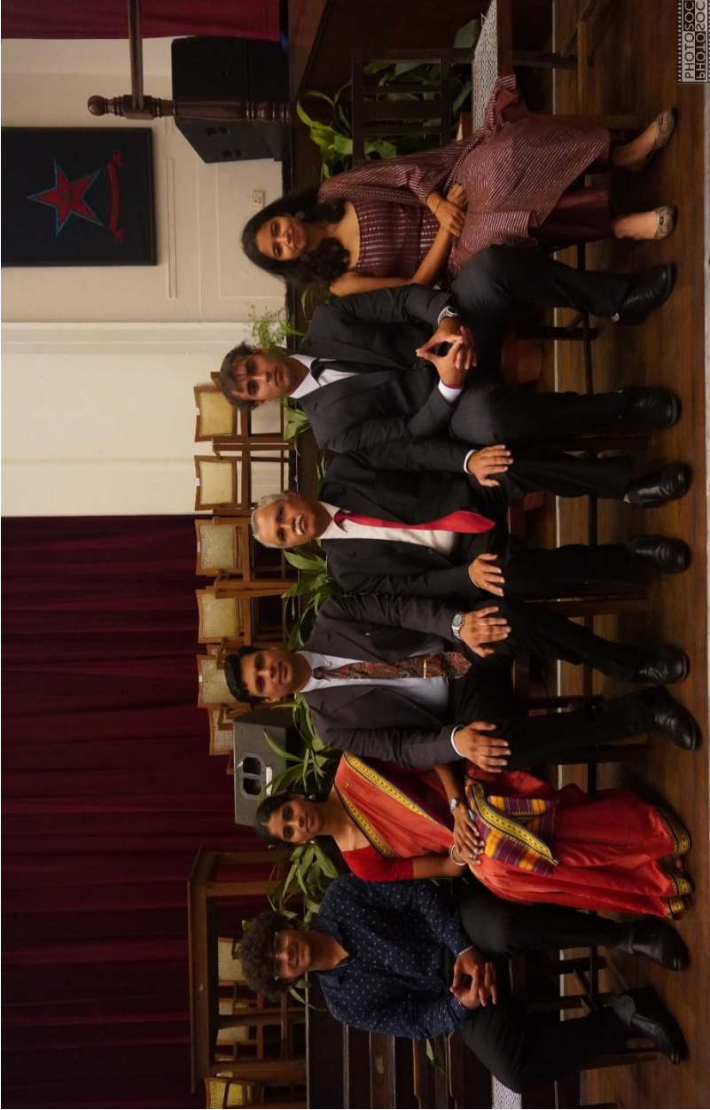
St. Stephen's College Team -- LAWN TENNIS (Women)