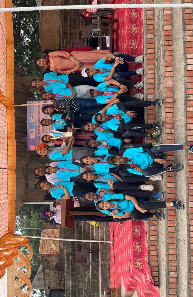
Delhi University Team – SOFT BALL (Women)