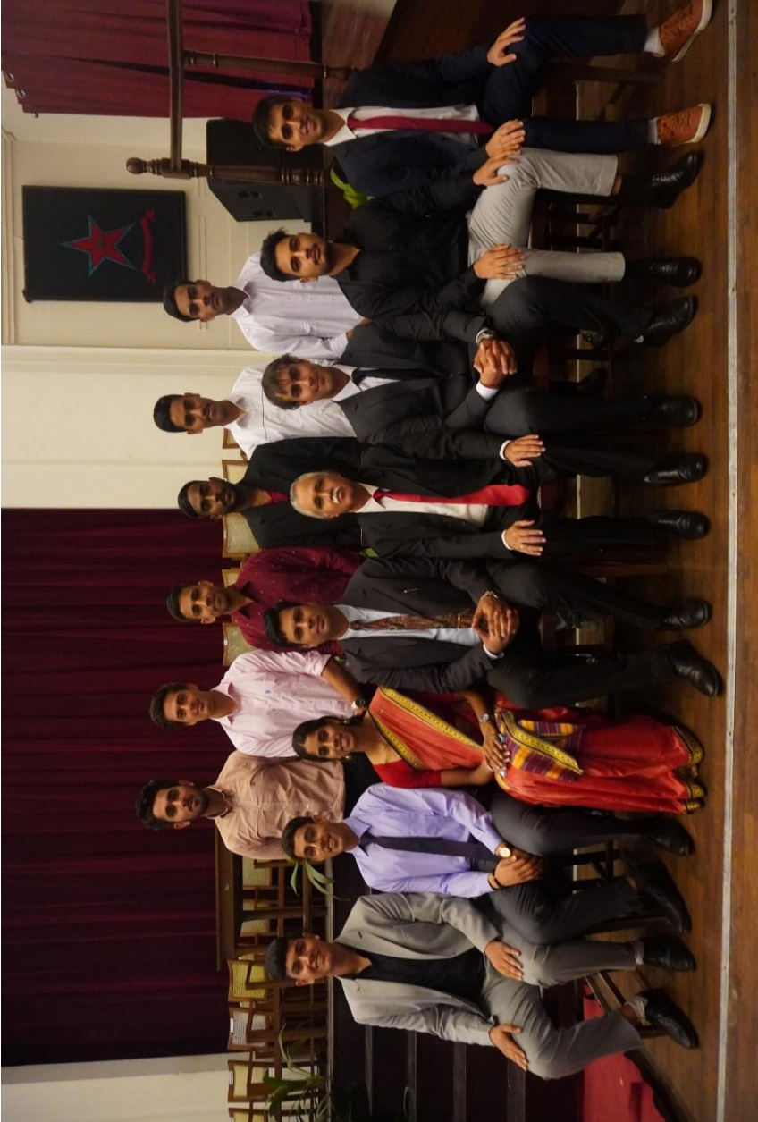
St. Stephen's College Team – CRICKET