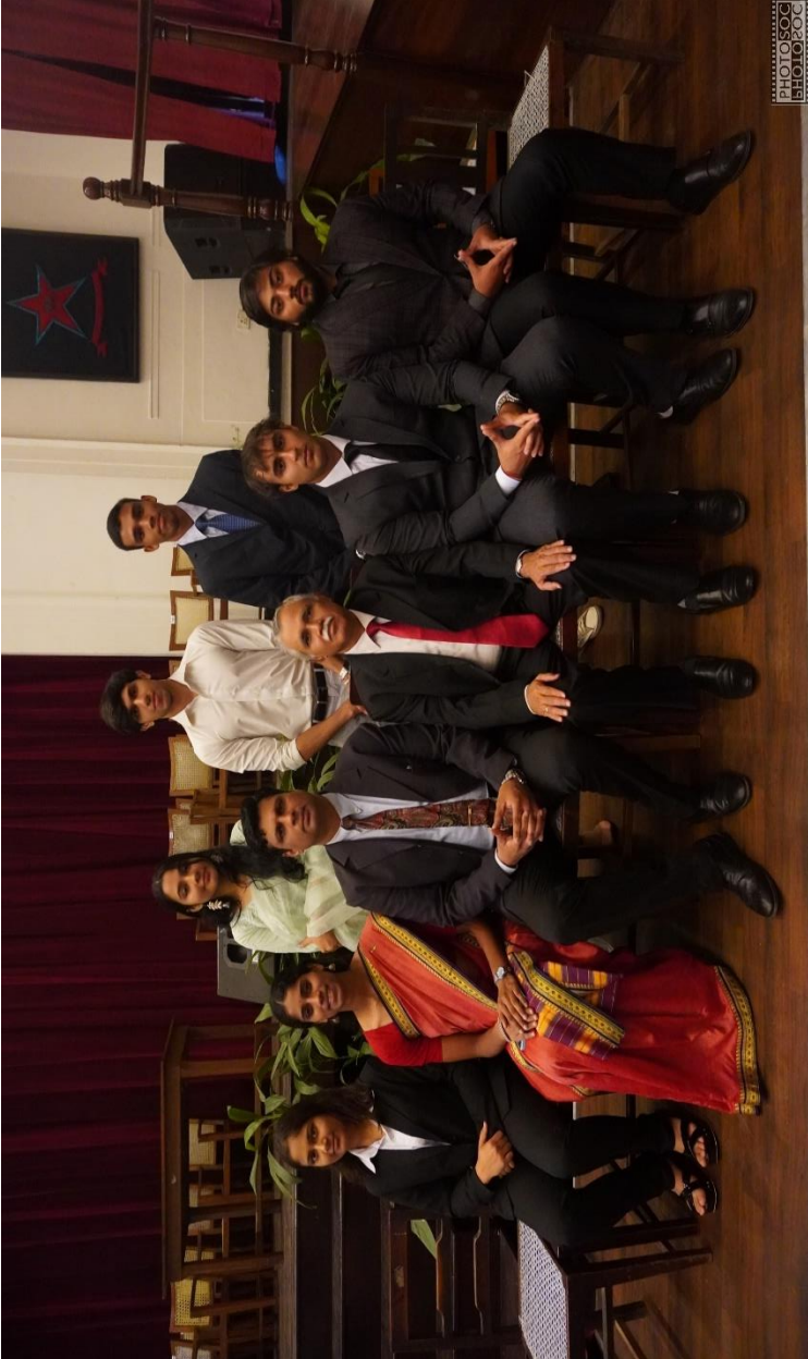
St. Stephen's College Team – SHOOTING (Men)