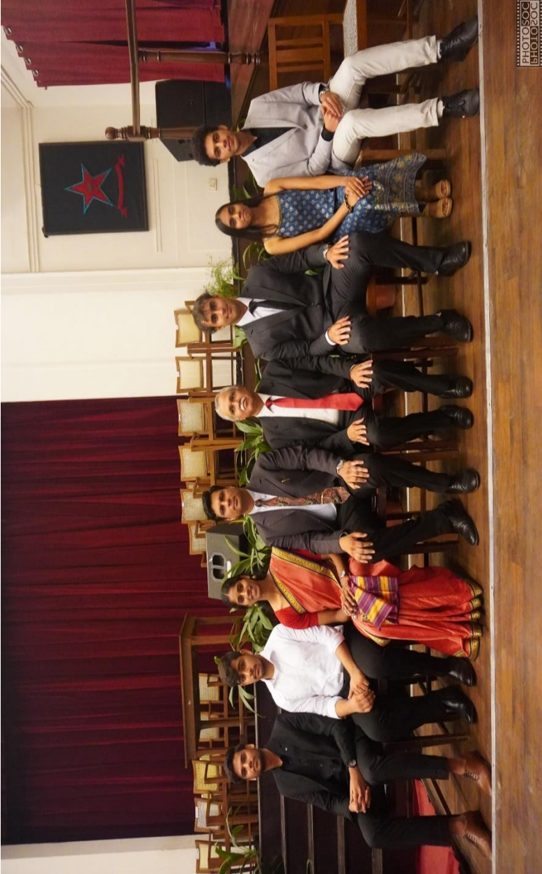
St. Stephen's College Team – BADMINTON (Men & Women)