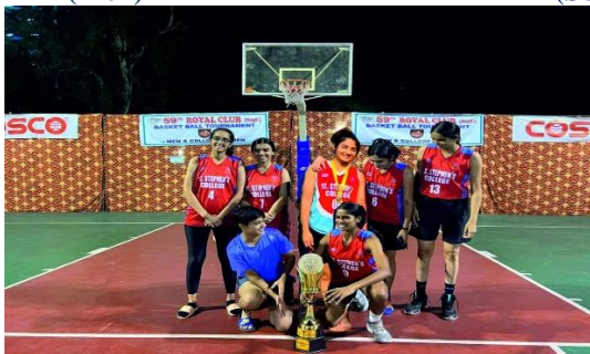
St. Stephen's College Basketball Team