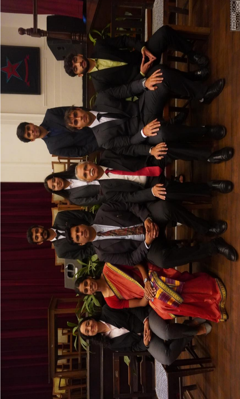
St. Stephen's College Team – TABLE TENNIS (Men)