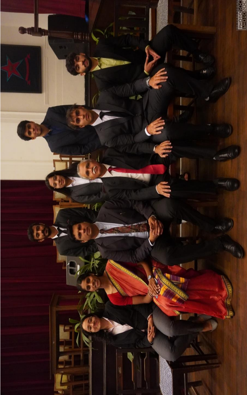
St. Stephen's College Team – TABLE TENNIS (Women)