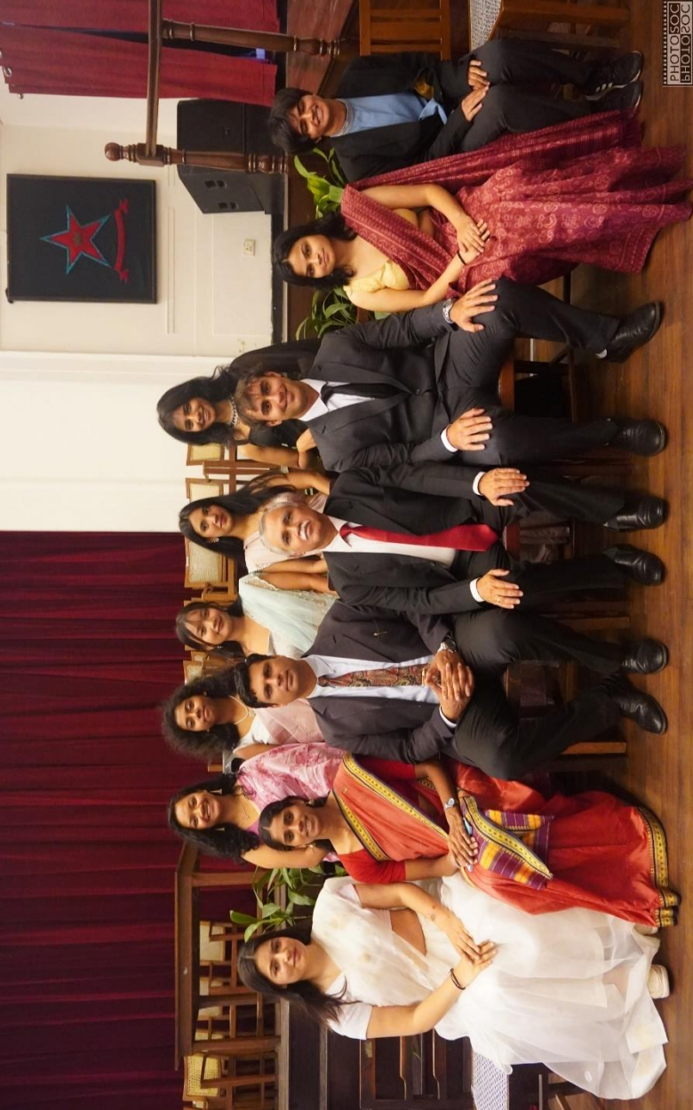
St. Stephen's College Team – FOOTBALL (Women)