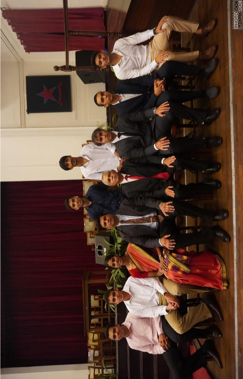
St. Stephen's College Team – SQUASH (Men)