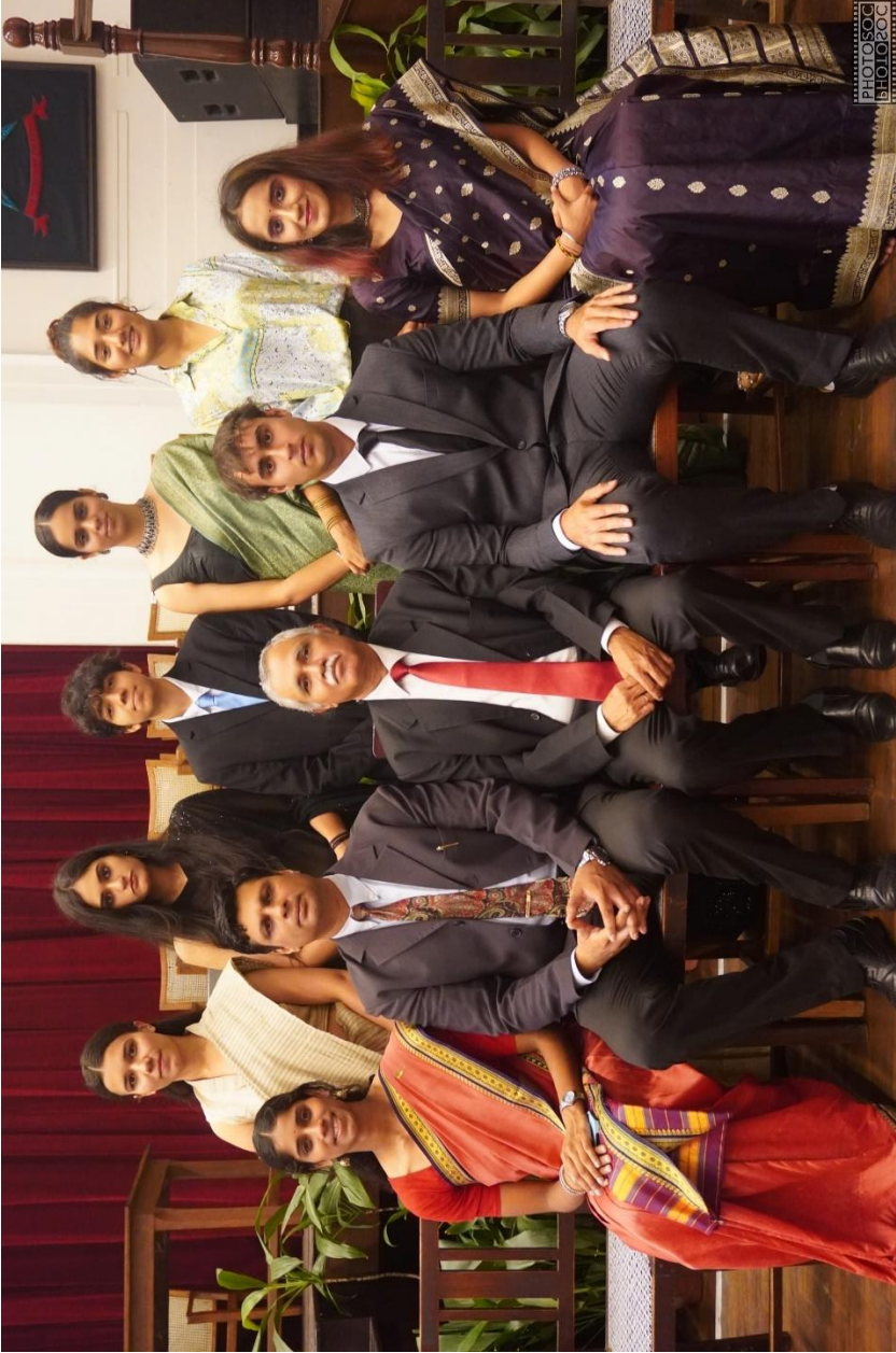
St. Stephen's College Team – BASKETBALL (Women)