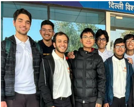
Delhi University Champions Chess Team (Men)