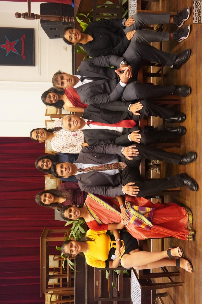
St. Stephen's College Team – CHESS (Women)