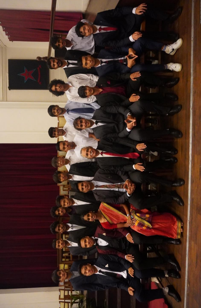
St. Stephen's College Team - FOOTBALL (Men)