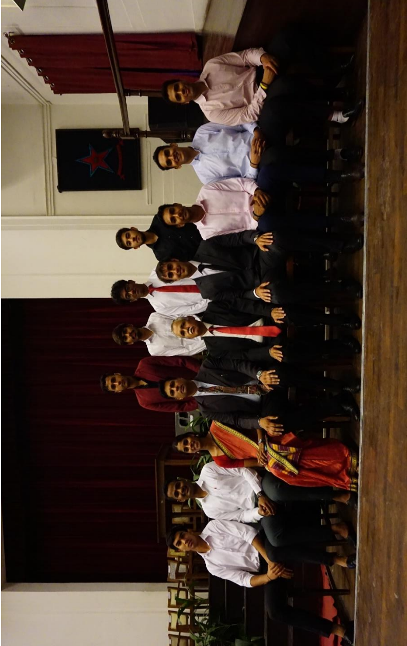
St. Stephen's College Team – BASKETBALL (Men)